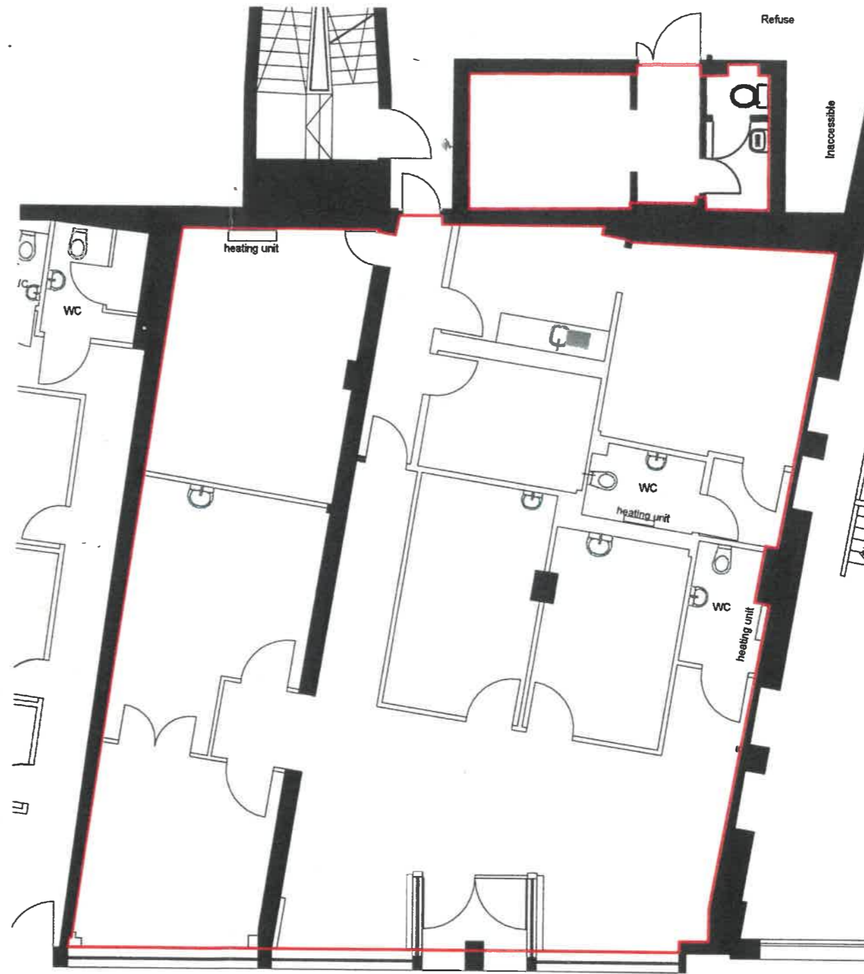
Ground Level - No. 61-65